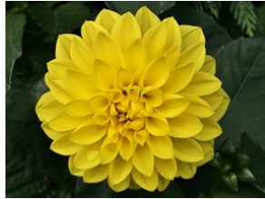
No 2. Flower in the Rain Nigel Tompkins