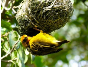
No 1 Southern Masked Weaver Dave Parker