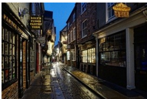
No 5. Shambles by Night Melvyn Lowther