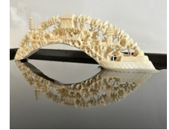
Paul Davis Vintage Ivory Bridge