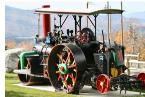
Loving the Lights, F.B.

Below, the first 4 images were chosen by group 1 to be