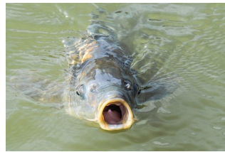
Fish at Bodiam Castle Nigel Tompkins