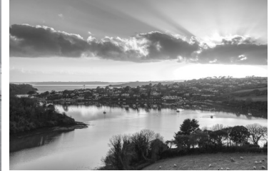
St Mawes at sunset