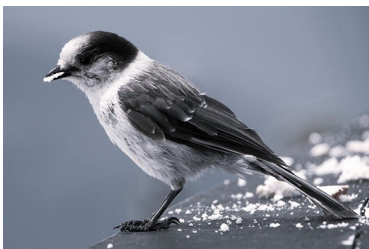
Grey Jay CP