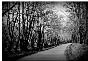
Tree lined avenue DH